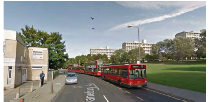
Current situation looking west, showing long queue of buses