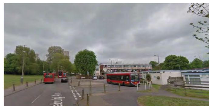
Current situation looking east, showing single space current bus turnaround and queuing buses on the carriageway