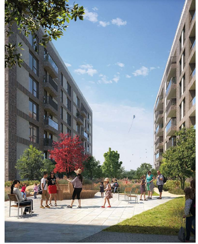
Computer Generated Images

Enhancements have been made to the accessibility of the residential accommodation. These include amendments to the designs of Blocks A, K, M and N including the relocation of access points, reducing the lengths of corridors, additional lifts and changes to waste collection. The new application also includes a wheelchair route between the new village square and Hersham Close, additional level crossings, more seating, and extra vehicle and cycle parking.