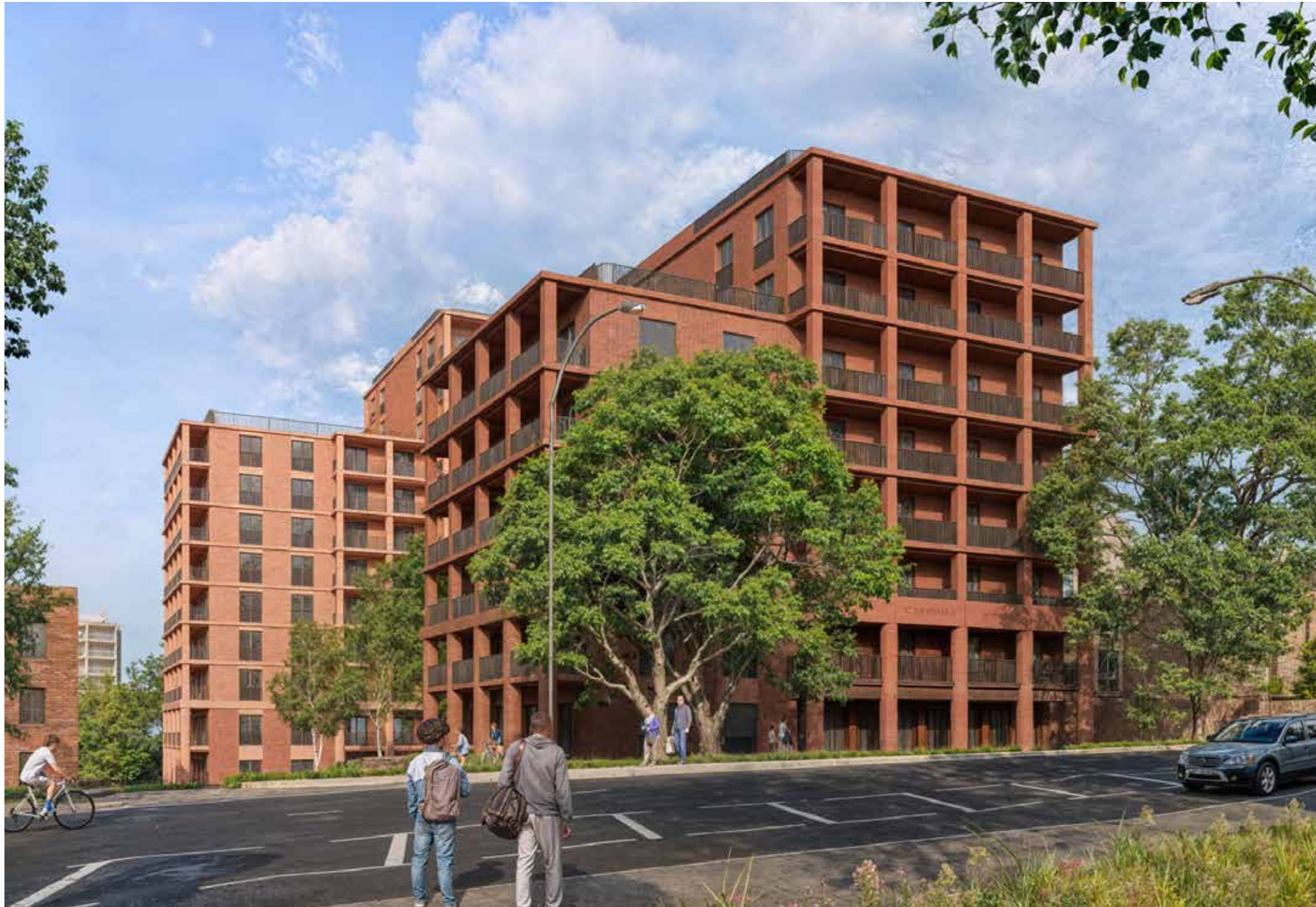
Proposed view of new homes at 166 Roehampton Lane