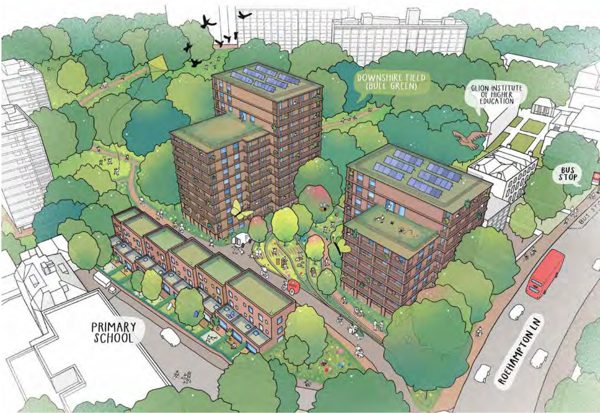
166 Roehampton Lane will be designed as a residential neighbourhood with a mix of houses and flats surrounded by green space