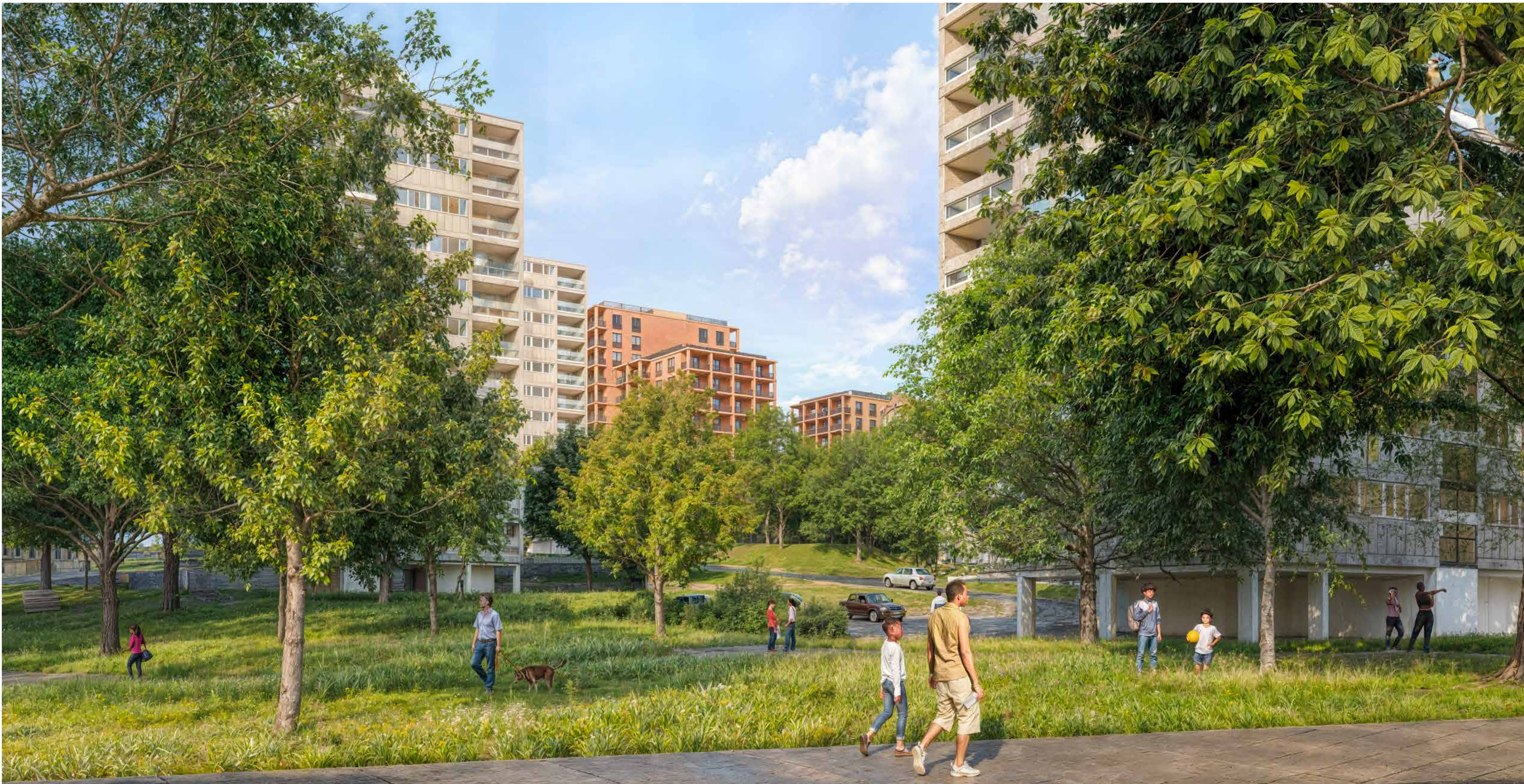
Proposed view of new homes at 166 Roehampton Lane

New family homes set in the existing landscape